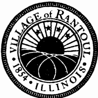
_____ Village President