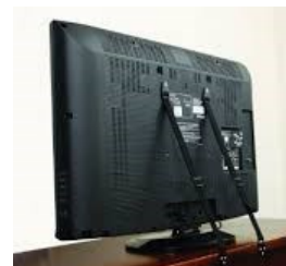
Flat-Panel TV (rear view)

Pickup of TV from your home when a replacement TV is delivered by Geek Squad® or by Best Buy Home Delivery is $19.99.